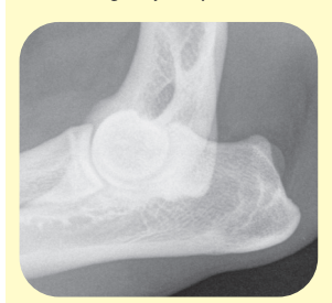
X-ray of a normal elbow joint

Radiography is commonly used to investigate joint problems.