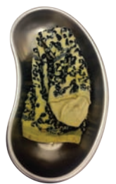
A very expensive sock that was removed from the intestines of a dog

So – as well as trying to ensure your pets don’t eat these objects, we strongly recommend pet insurance to cover you against these unexpected eventualities!