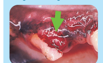
Resorptive lesion in a cat