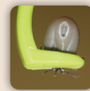
Close up of removed tick complete with mouthparts