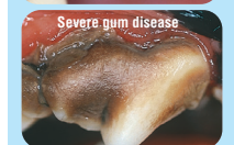
Progression of gum disease