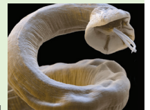
Electron-micrograph of an adult lungworm.

to their lungs. Here they develop into adult worms up to 2cm in size. The adults live and lay eggs inside the vessels of the lungs and the right side of the heart, causing symptoms such as coughing and exercise intolerance. Larvae migrate into lung tissue, causing blood clots, bleeding problems and even sudden death. The larvae are coughed up and pass out in the faeces where they are eaten by slugs and snails, so continuing the lifecycle.