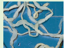
Tapeworms are long segmented worms which shed segments.

Tapeworms are long segmented worms which live inside the small intestines of cats and dogs. Adult tapeworms shed small mobile segments that pass out in the faeces and are often found around the tail areas of cats. As the segments break down, they release eggs into the environment. These eggs may be eaten by intermediate hosts – these include fleas and small rodents such as mice and voles. As a result, tapeworms can be acquired via food (cats eating small rodents) or via swallowing an infected flea during grooming. Pets with tapeworms may not show any obvious clinical signs, meaning that they can be carried silently.