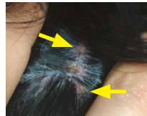
The bright orange mites often cluster together and are commonly found between the toes. Below: Harvest mite down the microscope

So – enjoy the autumn weather, but make sure your pets stay safe! Please call us if you would like any more information.