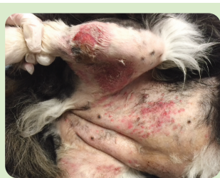
Typical photo of a suspected case of Alabama Rot with skin lesions

Fortunately, it is still very rare and additionally, most skin lesions will not be related to Alabama Rot; however, if you notice any unusual skin patterns on your dog's skin and need any advice please contact us straight away at the surgery.